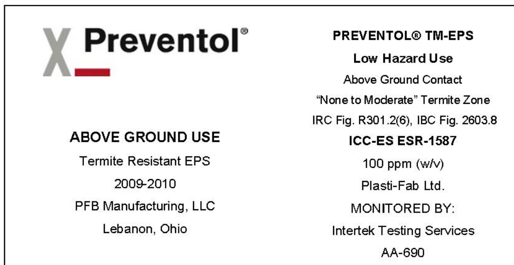
FIGURE 1—PREVENTOL® TM-EPS LOW HAZARD USE MARKING

2 Manufacturing locations include Delta, British Columbia, Canada, Kitchener, Ontario, Canada, Crossfield, Alberta, Canada, Saskatoon, Saskatchewan, Canada, Winnipeg, Manitoba, Canada, Ajax, Ontario, Canada, Lebanon, Ohio, Lester Prairie, MN