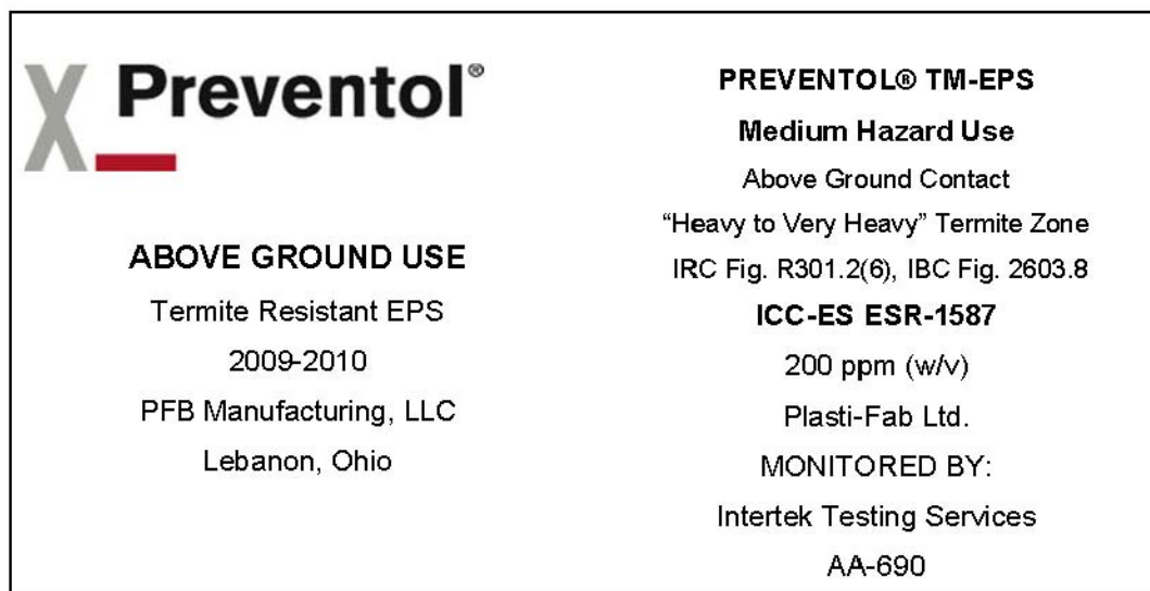
FIGURE 2—PREVENTOL® TM-EPS MEDIUM HAZARD USE MARKING